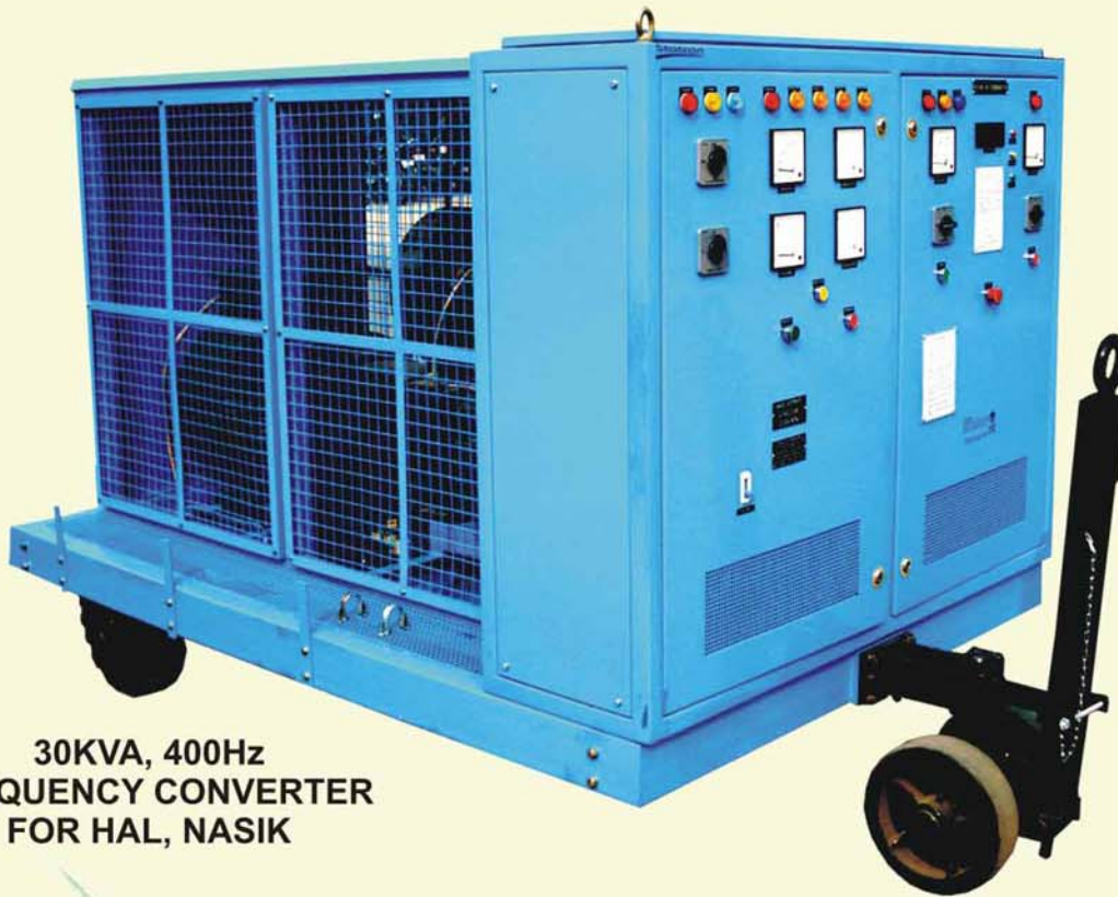
30KVA, 400Hz FREQUENCY CONVERTER FOR HAL, NASIK

Statcon's Rotary Frequency Converters are designed to meet the rugged but specific AC power requirements in different frequency ranges. It can be used to convert 50Hz/60Hz into any other frequency of 50Hz/60Hz/100Hz/200Hz or 400Hz