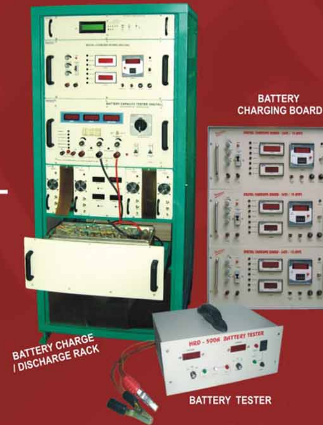
BATTERY CHARGE / DISCHARGE RACK