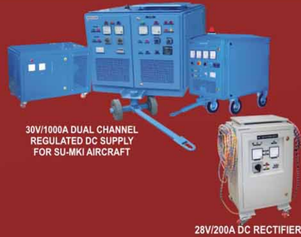
30V/1000A DUAL CHANNEL REGULATED DC SUPPLY FOR SU-MKI AIRCRAFT

Helo Starting Rectifier for Navel requirements is also available.