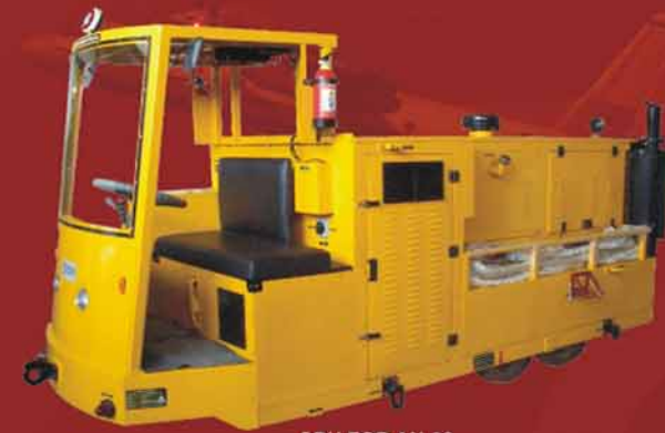
GPU FOR AN-32