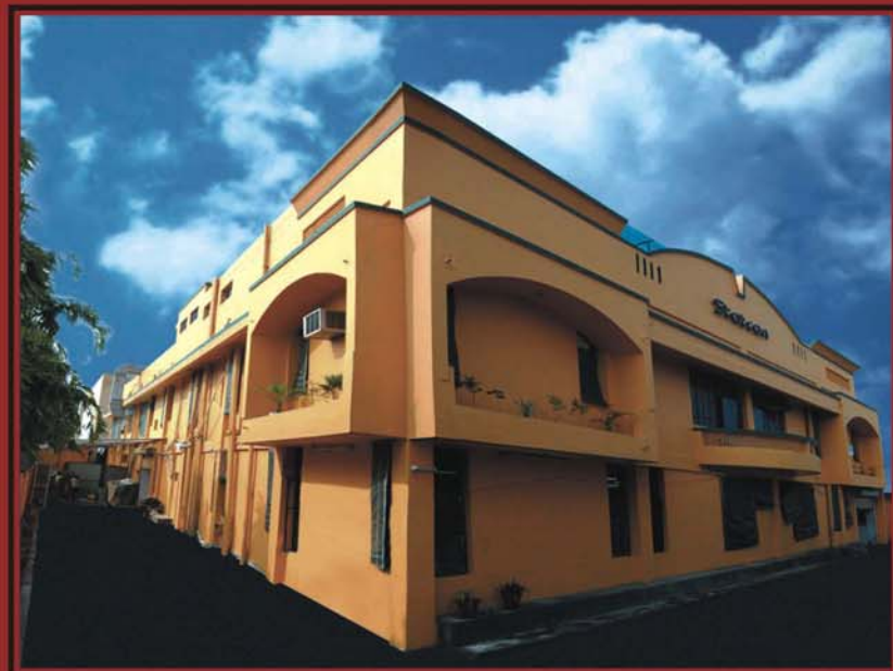
Statcon Power Controls Ltd.