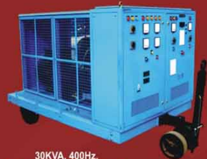
30KVA, 400Hz. FREQUENCY CONVERTER FOR HAL, NASIK

Frequency Converter of other frequencies and ratings can also be designed & supplied.